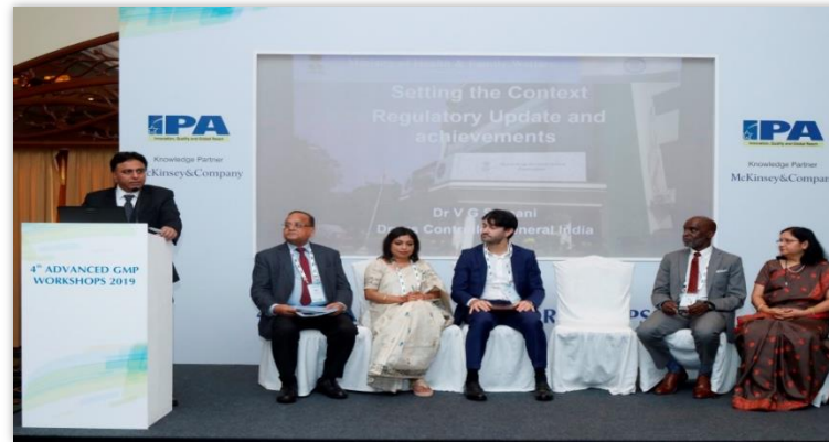
Advanced GMP workshops, Nov 2019