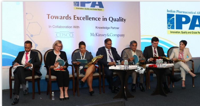
PA conference, Feb 2019