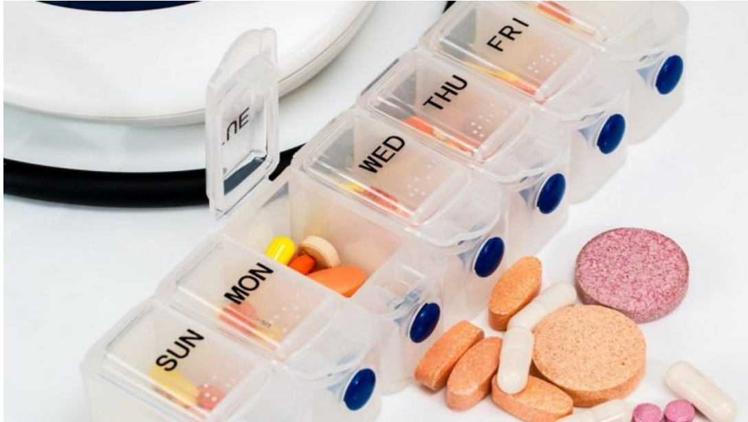
Representational image for pills